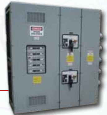
Prime Power control & Distribution building package for US military facility in the Middle East. Interior view of switchgear, rated 2000A @11kv 50Hz.